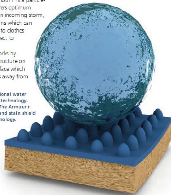
Right: The Armour+ rain and stain shield technology.